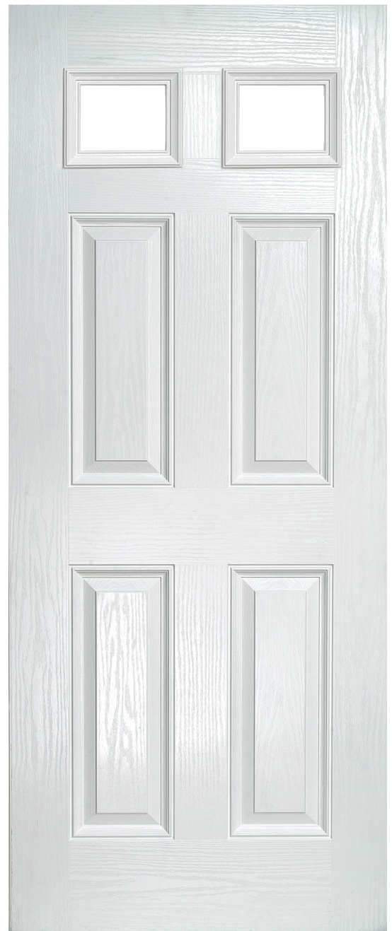
68P 9S Glazing