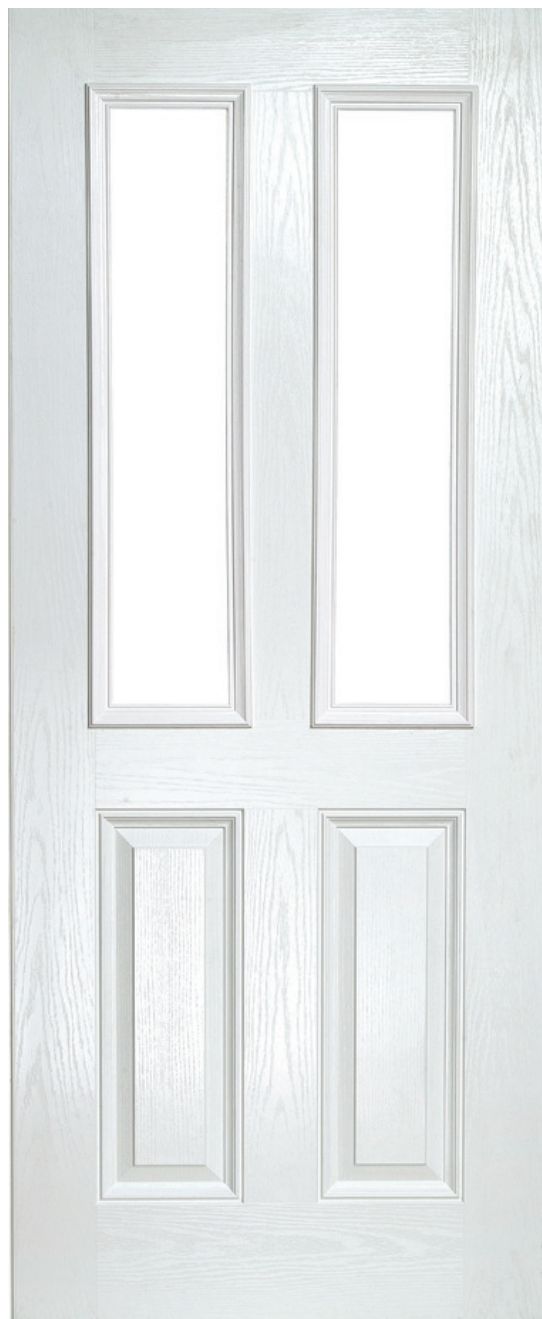
48P 9N Glazing